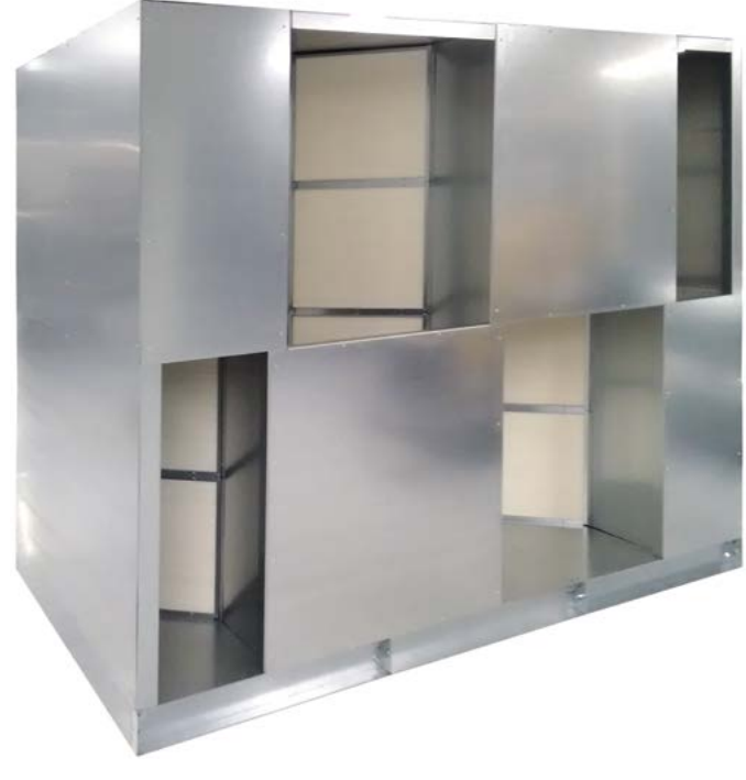
The SA Series Energy Recovery Core Array unit from RenewAire.

The SA Series Energy Recovery Core Array, which is manufactured by energy recovery ventilation equipment manufacturer RenewAire, Waunakee, Wis., preconditions the outdoor air to reduce the latent and sensible